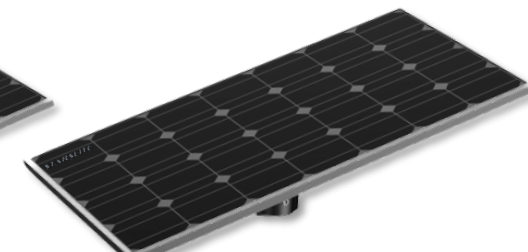
for 120W LED lamp