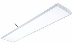
GreenUp Highbay linear G3 BY493P